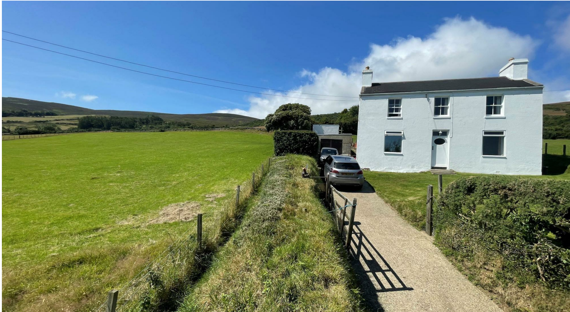
Glen Mona Cottage Main Road, Ramsey, Isle Of Man, IM7 1HR Asking Price £445,000