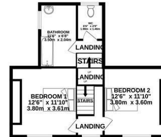
1ST FLOOR 486 sq.ft. (45.2 sq.m.) approx.